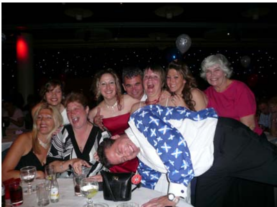
Edinburgh British games Gala dinner

Besides from that, have I mentioned the fantastic social side of it, I mean FANTASTIC!!! I never thought I'd be a tarty tartan type trouble-some lass (hee hee), guess there is photographic evidence of me (gulp). All in all - I could sing the Hamsters praises endlessly, but think due to editing that I may be cut off anyways at some point (hee hee). So, thank you all for a wonderful time, and I can't wait until the Games next year - and other events throughout the year too. And I hope to see new faces next year to share on the fun, oodles of laughter and sporting activities.