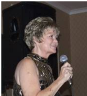
Lone star state-ment from Tylene.