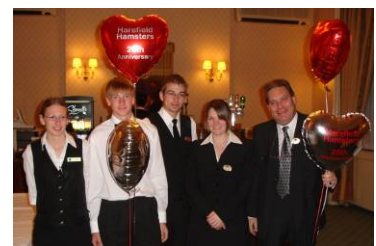
Fantastic Midland hotel staff.